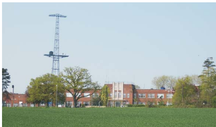
Figure 4 - The 1939 art deco office building, with the mast in the background