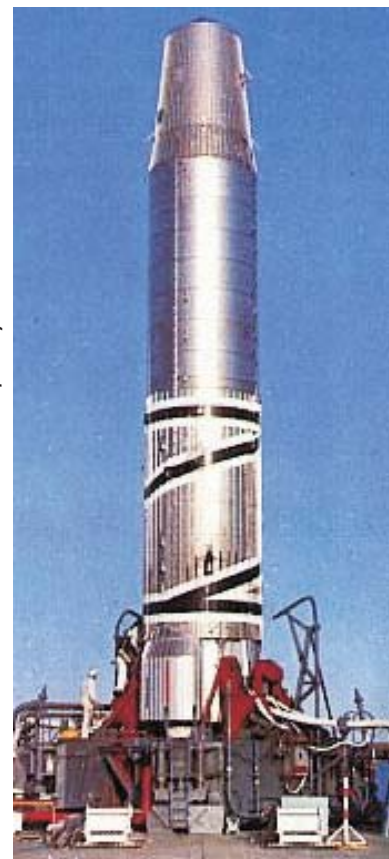
Figure 5 - The Blue Streak ballistic missile developed for the cold war, operational from 1955, with a radio guidance system developed by Marconi at Great Baddow