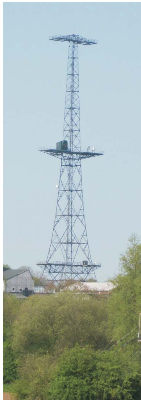
Figure 6 - The mast from the southeast

RCHM (1999), Buildings of the Radio Electronics Industry Chelmsford. English Heritage (1997 and 2007), unpublished. www.rafweb.org www.radarpages.co.uk