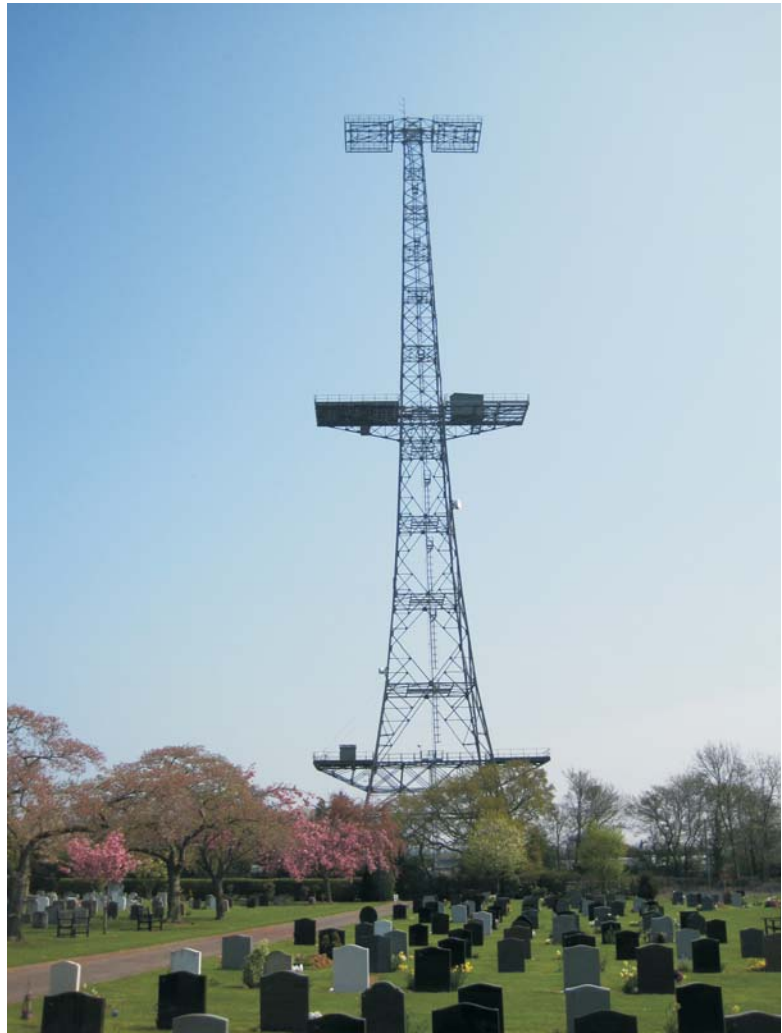
Figure 1 - Great Baddow Mast from the west

This leaflet is part of a series which aims to raise awareness of the heritage of Chelmsford