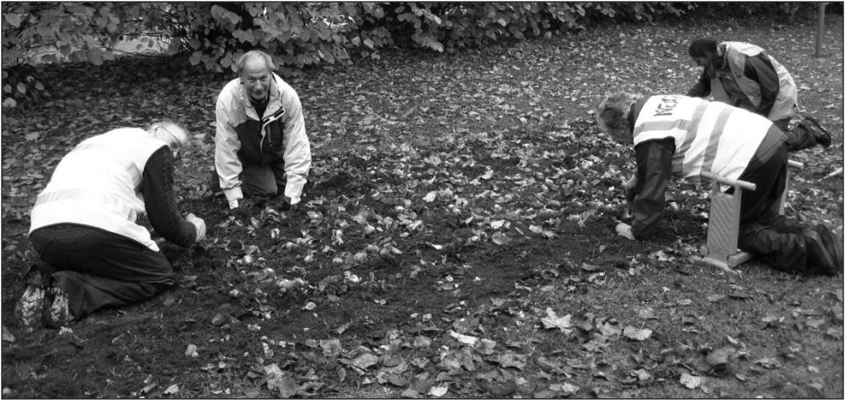
Volunteers helping to plant daffodil bulbs on the green behind Marrable House – look out for the flowers next spring!